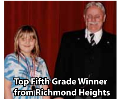
Top Fifth Grade Winner from Richmond Heights

With the inauguration of our 44 th President on January 20 th and Presidents' Day celebrated in February, United States Presidents were top of mind for students at Brooklyn High School. On Tuesday, February 24 th , more than 135 students in grades 4-8 came to the Brooklyn High School auditorium to compete in the Northeast Regional Academic Games Mr. Presidents' Competition organized through the Educational Service Center of Cuyahoga County.