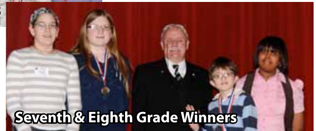
Seventh & Eighth Grade Winners

Students wrote to President Obama to congratulate him, as well as provided suggestions on what he should do to help the country.