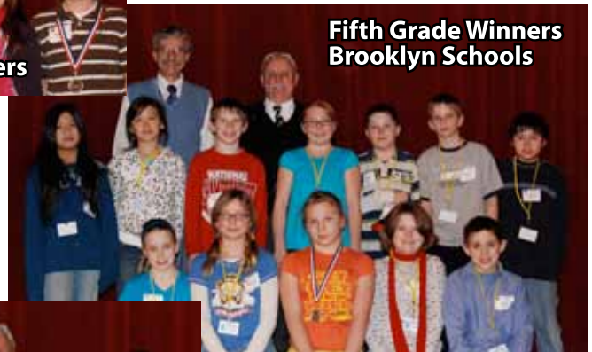
Fifth Grade Winners Brooklyn Schools