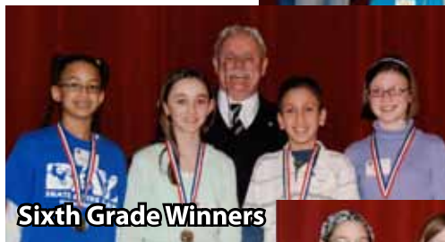
Sixth Grade Winners