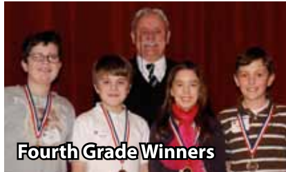
Fourth Grade Winners